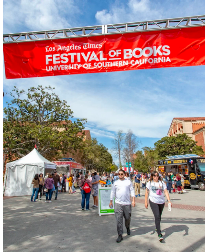
LA Times Festival of Books at USC